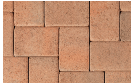
CREAM - TERRACOTTA - BROWN