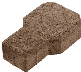
Keylock (80mm) 5.47" x 9.05" special order