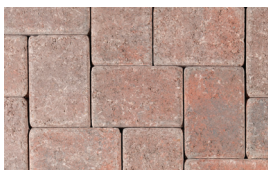
RED - BROWN - CHARCOAL