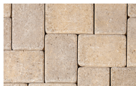
SAND - STONE