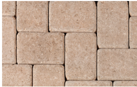
CREAM - BROWN

Blended Tumbled Colors (swatches shown in Antique Cobble I)