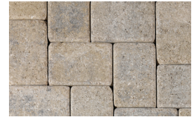
GRAY - MOSS - CHARCOAL