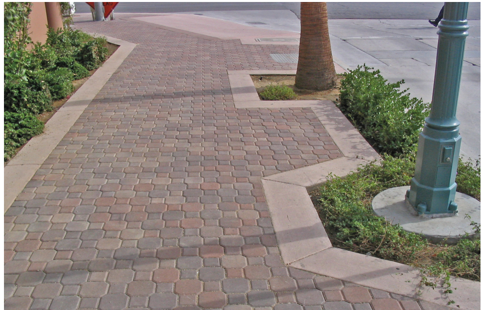
Shown: Keylock Cream-Brown and TerraCotta- Brown installed in a running bond pattern.

*Available in standard and tumbled textures.