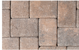
CREAM - BROWN - CHARCOAL