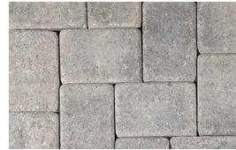
GRAY - CHARCOAL