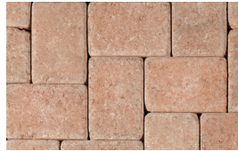
CREAM - TERRACOTTA - BROWN