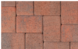
RED - BROWN - CHARCOAL