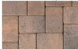
CREAM - BROWN - CHARCOAL