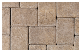
SAND - STONE - MOCHA