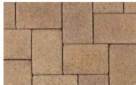
SAND - STONE