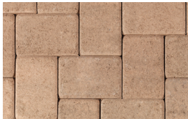
CREAM - BROWN

Blended Colors (swatches shown in Antique Cobble I)