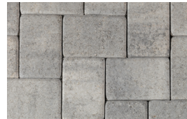
GRAY - CHARCOAL