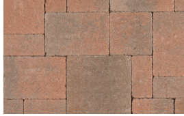
CREAM - TERRACOTTA - BROWN