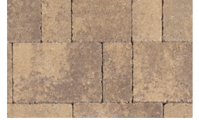
SAND - STONE - MOCHA