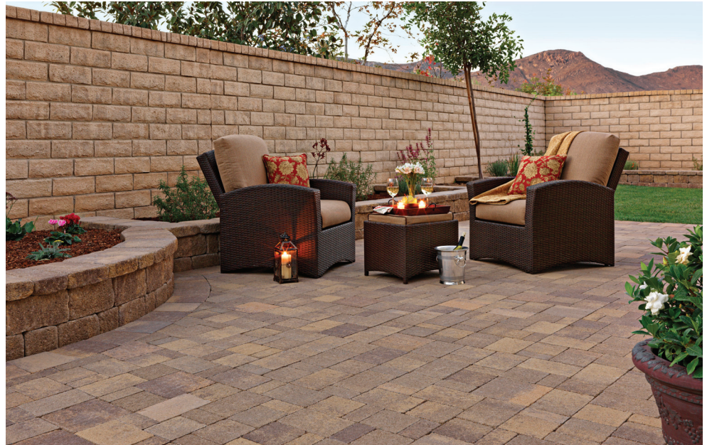
Shown: Sand-Stone-Mocha Castle Cobble I & II (distressed) installed in a random ashlar pattern.

Cream-Brown Cream-Brown-Charcoal Cream-TerraCotta-Brown Gray-Charcoal Gray-Moss-Charcoal Sand-Stone Sand-Stone-Mocha Tuscan