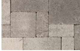
GRAY - CHARCOAL