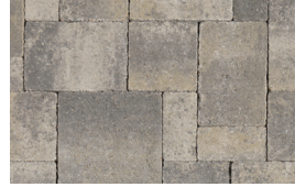
GRAY - MOSS - CHARCOAL