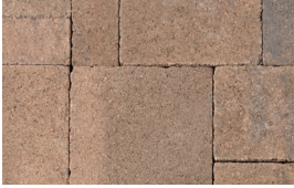
CREAM - BROWN - CHARCOAL

Distressed Blended Colors (swatches shown in Castle Cobble I)