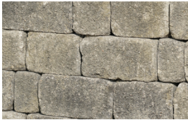
GRAY - MOSS - CHARCOAL