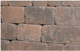
CREAM - BROWN - CHARCOAL

Colors (swatches shown in Stonewall® II)