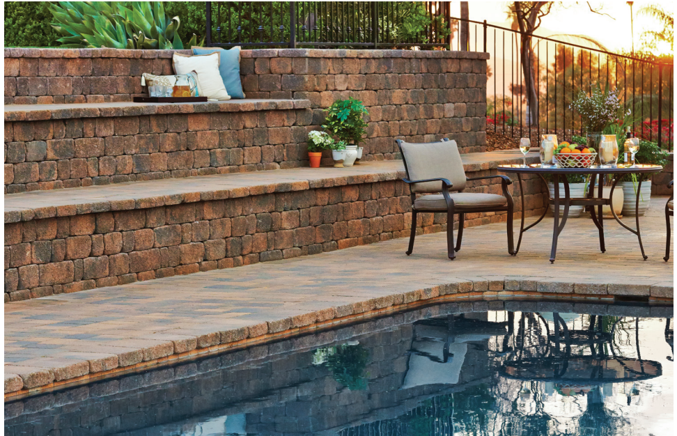
Shown: Cream-Brown-Charcoal Stonewall® II seating wall and pool coping with Cream-Brown-Charcoal Courtyard Stone installed in an ashlar pattern.

Angelus Stonewall® II Olympic Series is a seven-stone package of textured units in warm, earth-toned colors, complemented with the Stonewall® II Caps package. These units offer a versatile medium for creative expression in any landscape design, ideal for seat walls, decorative low-rise walls, low retaining, columns, barbeque enclosures, and more.