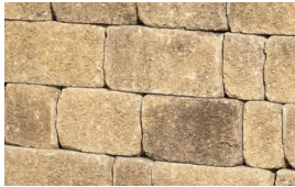
SAND - STONE - MOCHA